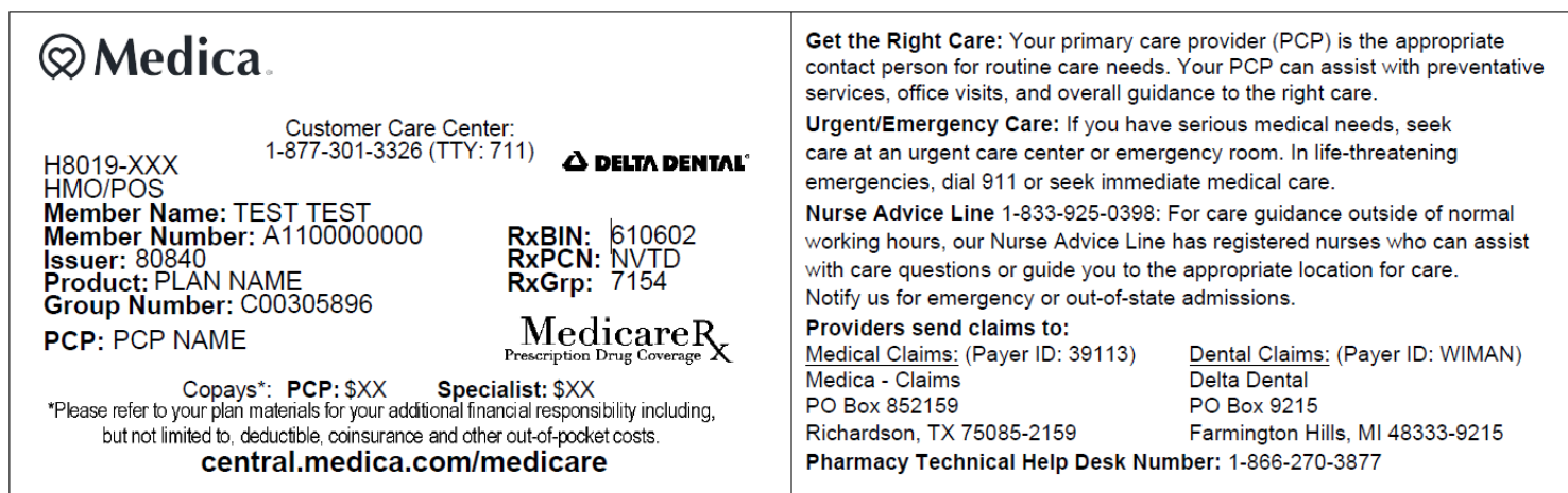
FRONT – MEMBER WITH PART D