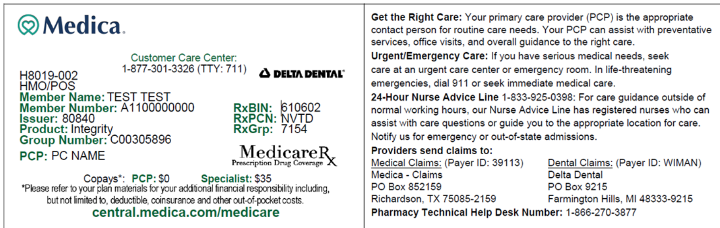
FRONT – MEMBER WITH PART D

The Medica Advantage member ID cards have the Medica logo in the top left corner. They list the shortened plan name (e.g., Harmony, Integrity) in which the member is enrolled. The Medicare Rx logo is on member ID cards for members who have prescription drug (Part D) coverage.